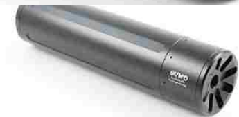
1.6 x 6.25 inch SUMO