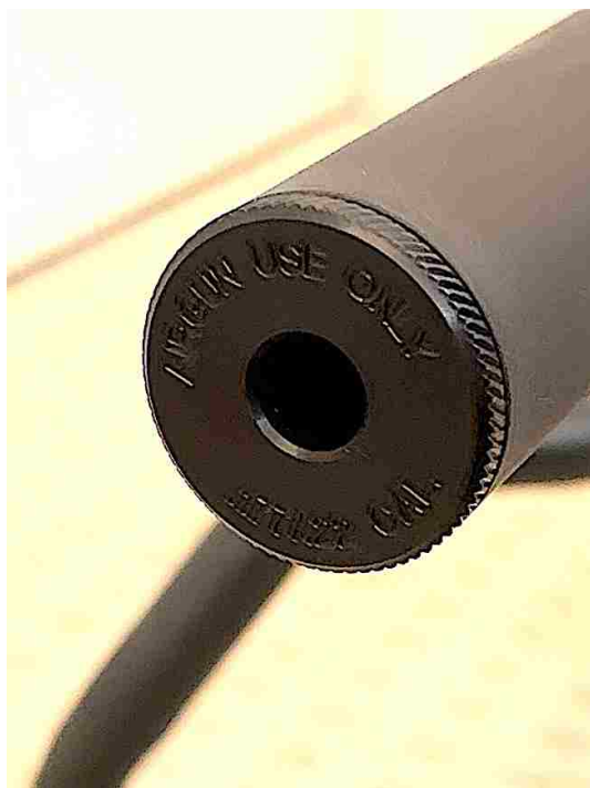
PICS of A.U.O. (MM1)