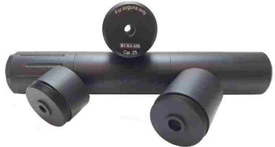
MOD40-5/0 = Long | 22.8cm