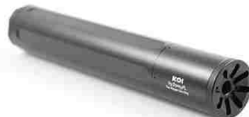
1.22 x 7 inches KOI