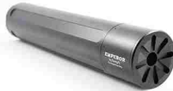
2 x 10.5 inches EMPEROR v3