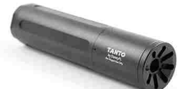
1.22 x 5 inches TANTO