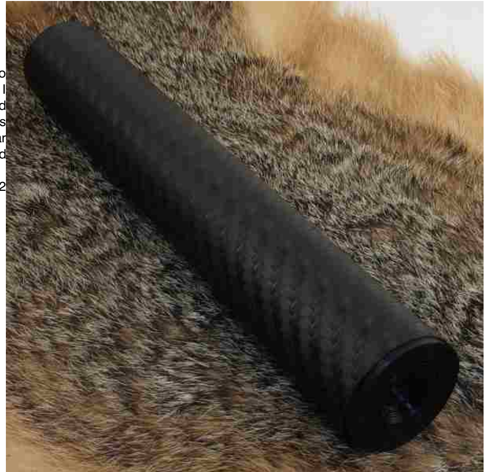
Construction: 3D printed monocoire set in a polymer shell with a decorative vinyl wrap

https://www.gatewaytoairguns.org/GTA/index.php?topic=178083.msg156020266#msg156020266