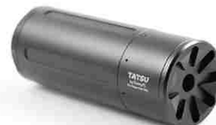
1.6 x 4.25 inches TATSU