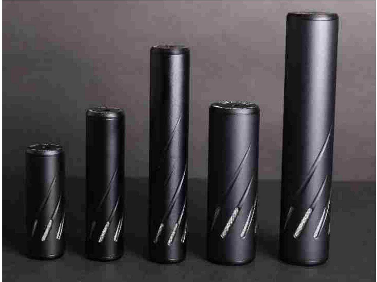
L to R: Atom, Belita, Snipe, Mini-Magna, Magna.