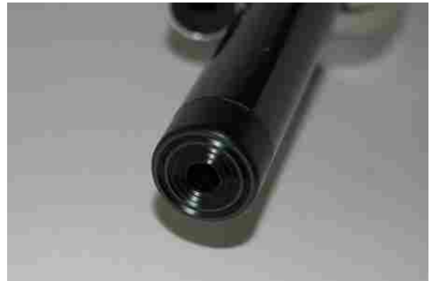
“Various end cap treatments. This one was ‘ringed.’”