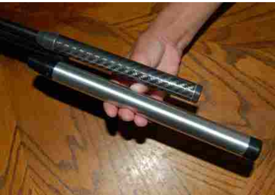
With end caps With silver rings