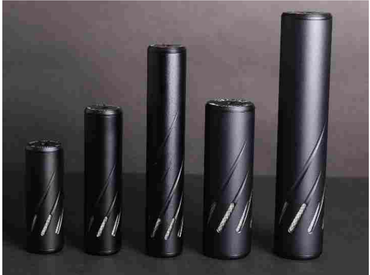
L to R: Atom, Belita, Snipe, Mini-Magna, Magna.