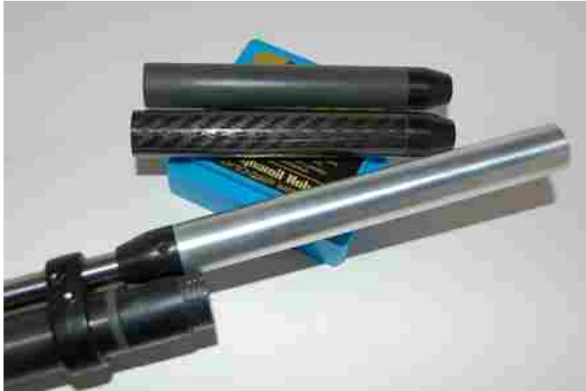
Colors (top to bottom): • Olive drab • CF (carbon fiber) wrapped • Brush alu