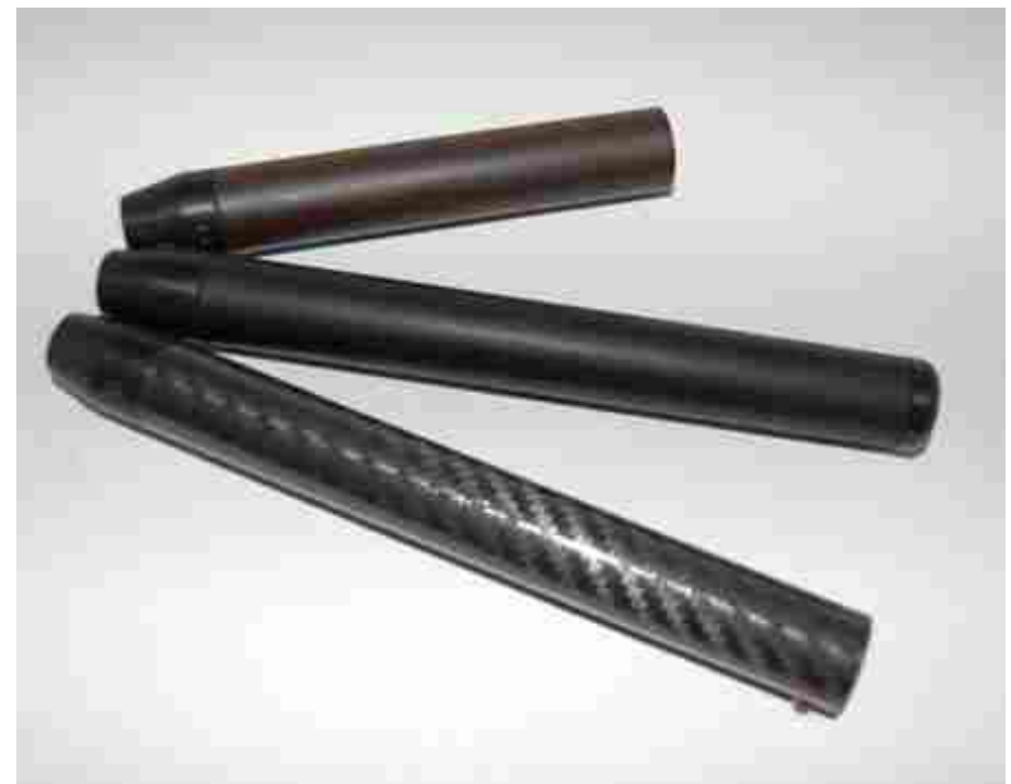
Colors (top to bottom): • Brown • Ultra black • CF (carbon fiber) wrapped